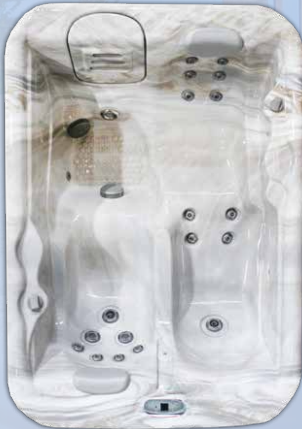
*Shown in Smoky Mountain