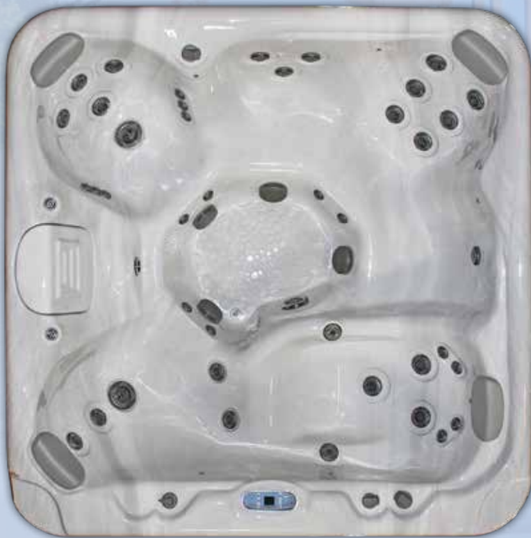
*Shown as LE Version